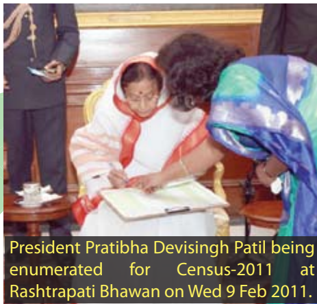
President Pratibha Devisingh Patil being enumerated for Census-2011 at Rashtrapati Bhawan on Wed 9 Feb 2011.

The gigantic exercise of head counting India's estimated 1.2 billion population, the world's second largest after China has begun. The nationwide exercise, which will continue over the next three weeks, began as a group of officials, called enumerators, visited President Pratibha Patil at the Rashtrapati Bhavan, the presidential palace. The decadal exercise, which will be the 15th headcount of India's population since 1872, is undertaken to create a database on demography, economic activity, literacy and education, housing and household amenities, urbanization, fertility and mortality, social structure, language, religion, and migration. A similar exercise would be carried out in more than 7,000 towns and 600,000 villages across the country, including in troubled Jammu and Kashmir.