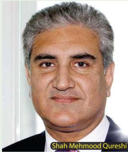
Shah Mehmood Qureshi

In order to solve all outstanding issues, the Pakistan Foreign Minister would visit India before July. Before Foreign Minister Visit to India, secretaries and officials of the two countries will hold a series of meetings to discuss issues like counter-terrorism, peace and security, Kashmir, Siachen and economic matters. It is believed that during the meeting of foreign secretaries of both countries, the two sides have agreed to resume dialogue on all issues.